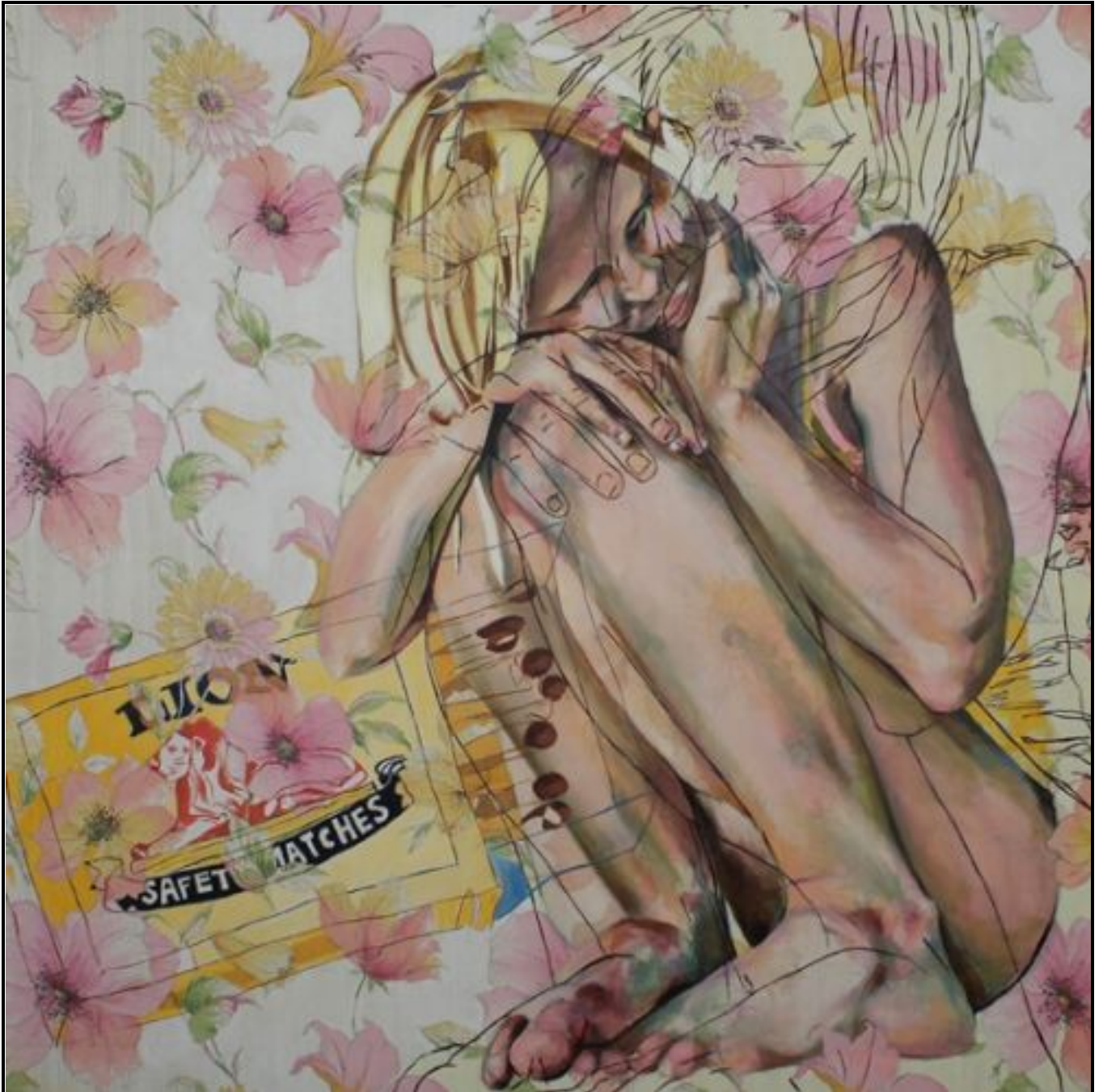
FIGURE 6: Varenka Paschke, Safely Matched , acrylic paint, 2006.