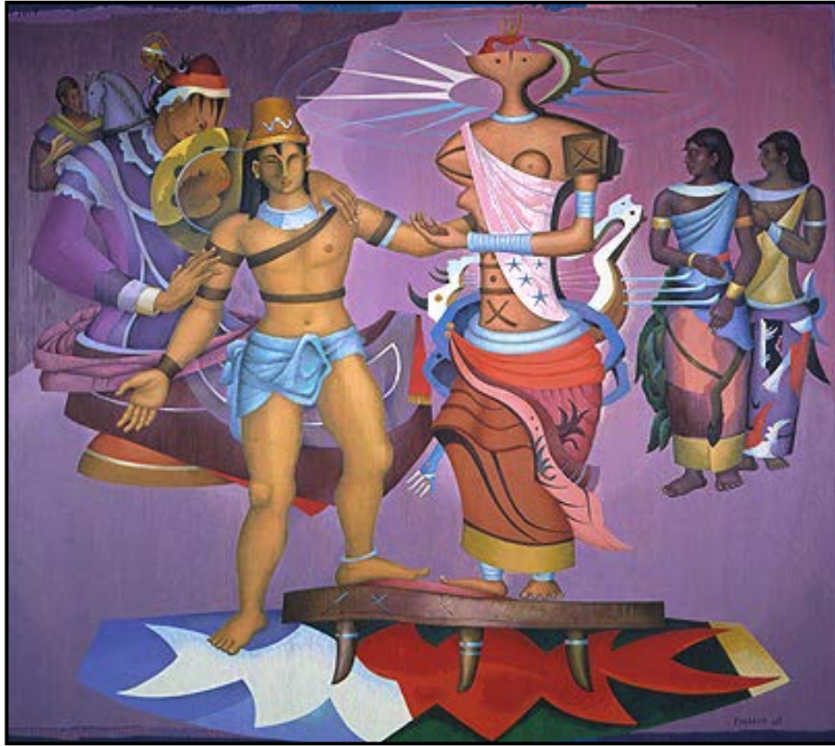
FIGURE 2a: Alexis Preller, Primavera , oil on canvas, 1965.