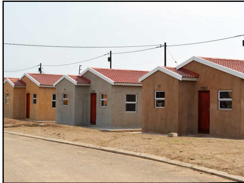
FIGURE 8a: Reconstruction and Development Programme, South Africa, implemented in 1994.