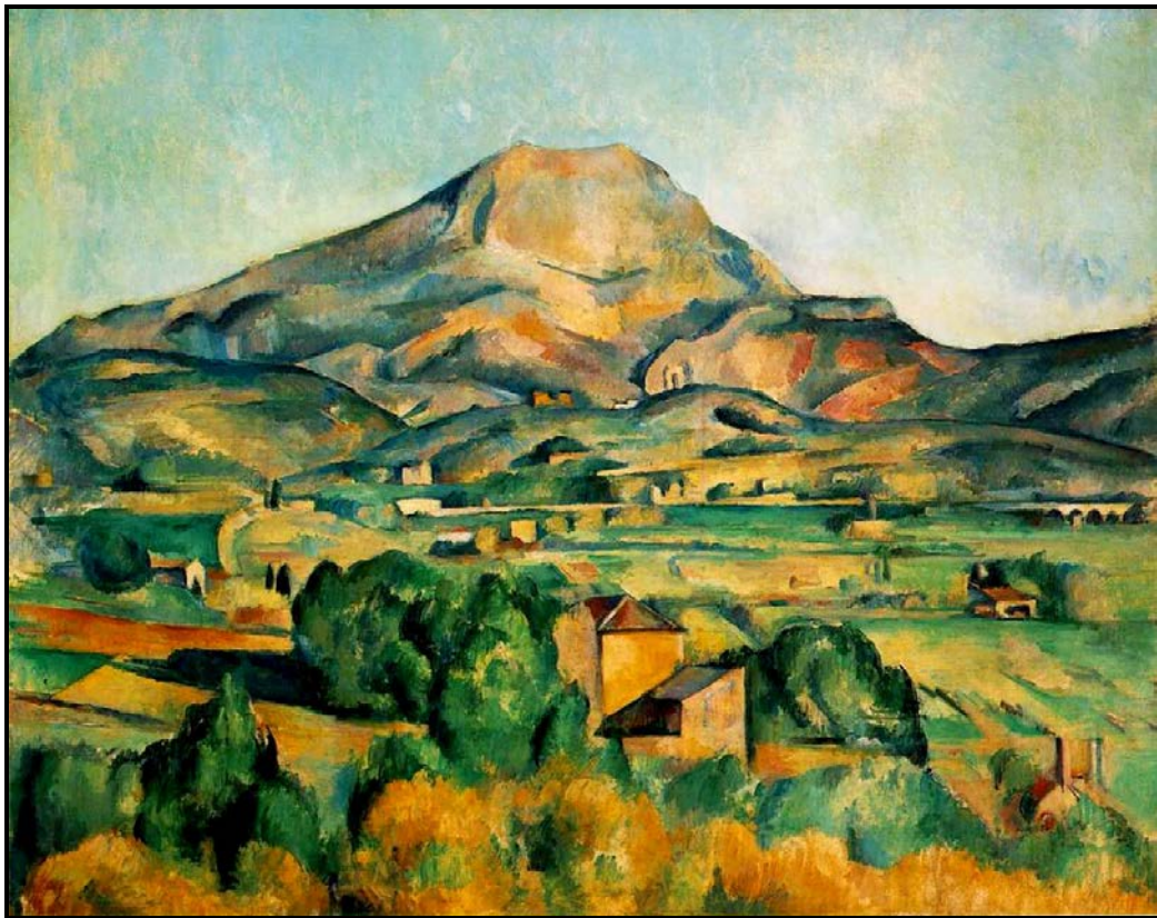
FIGURE 1a: Paul Cézanne, Mont Sainte-Victoire Seen from Bellevue , oil on canvas, circa 1885.