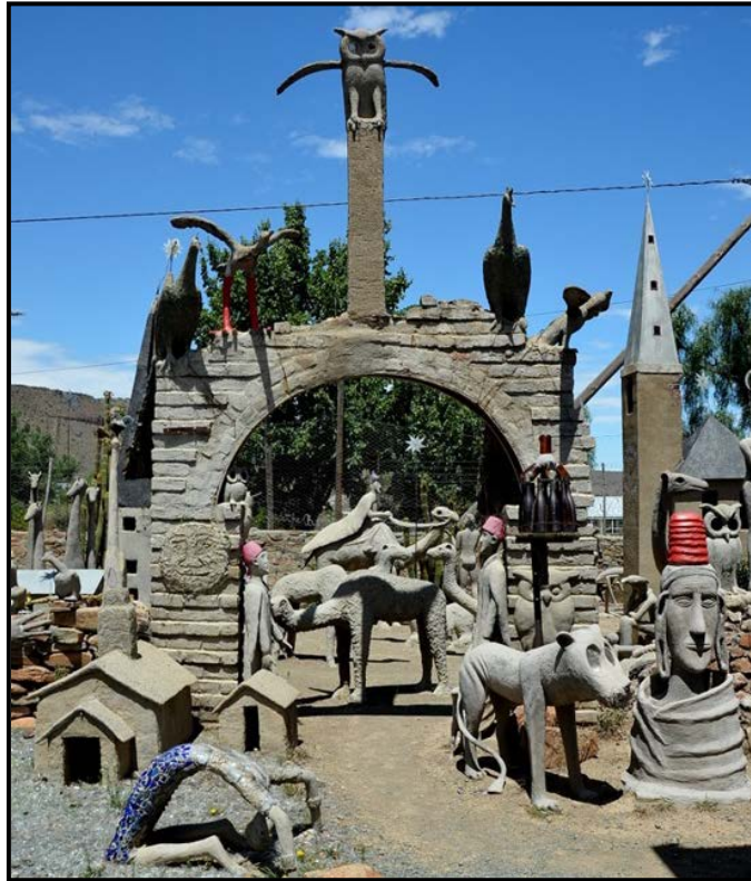
FIGURE 4a: Helen Martins (1897–1976), Owl House , Nieu-Bethesda, cement, glass and wire.