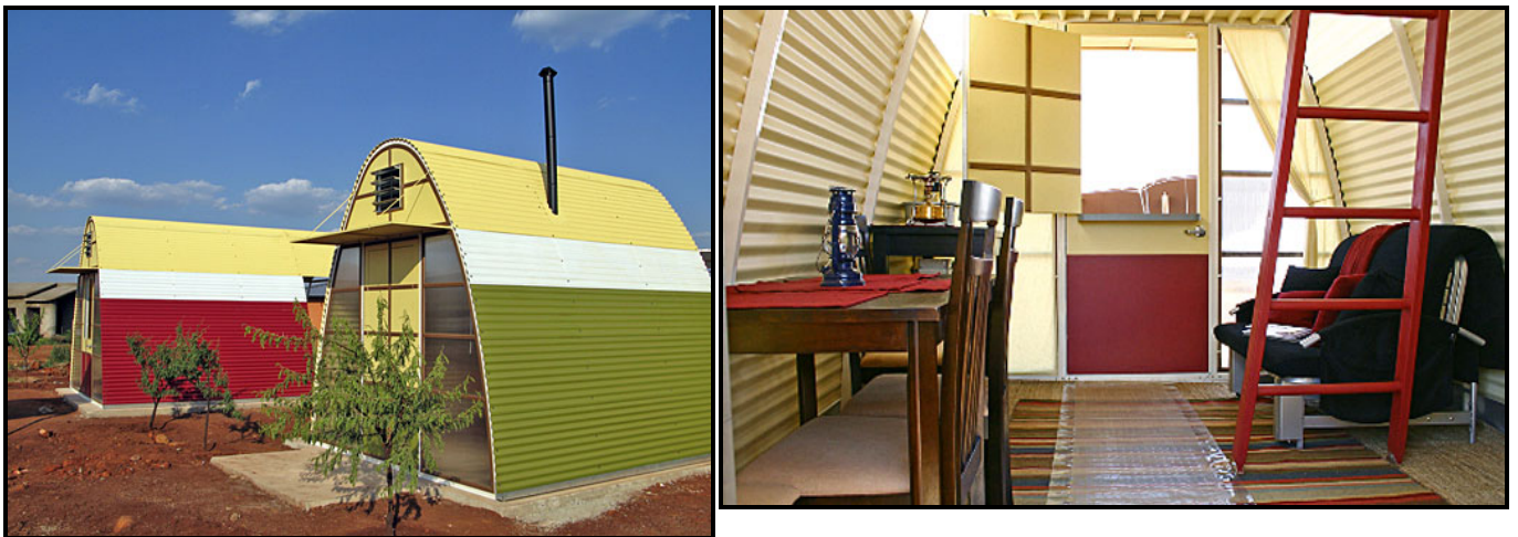
FIGURE 8b: BSB Design, Architecture for A Change, (AFAC) . Prototype for the use of affordable/micro-housing in South Africa, solar panels, corrugated metal, glass, 2013. (Exterior and interior views)