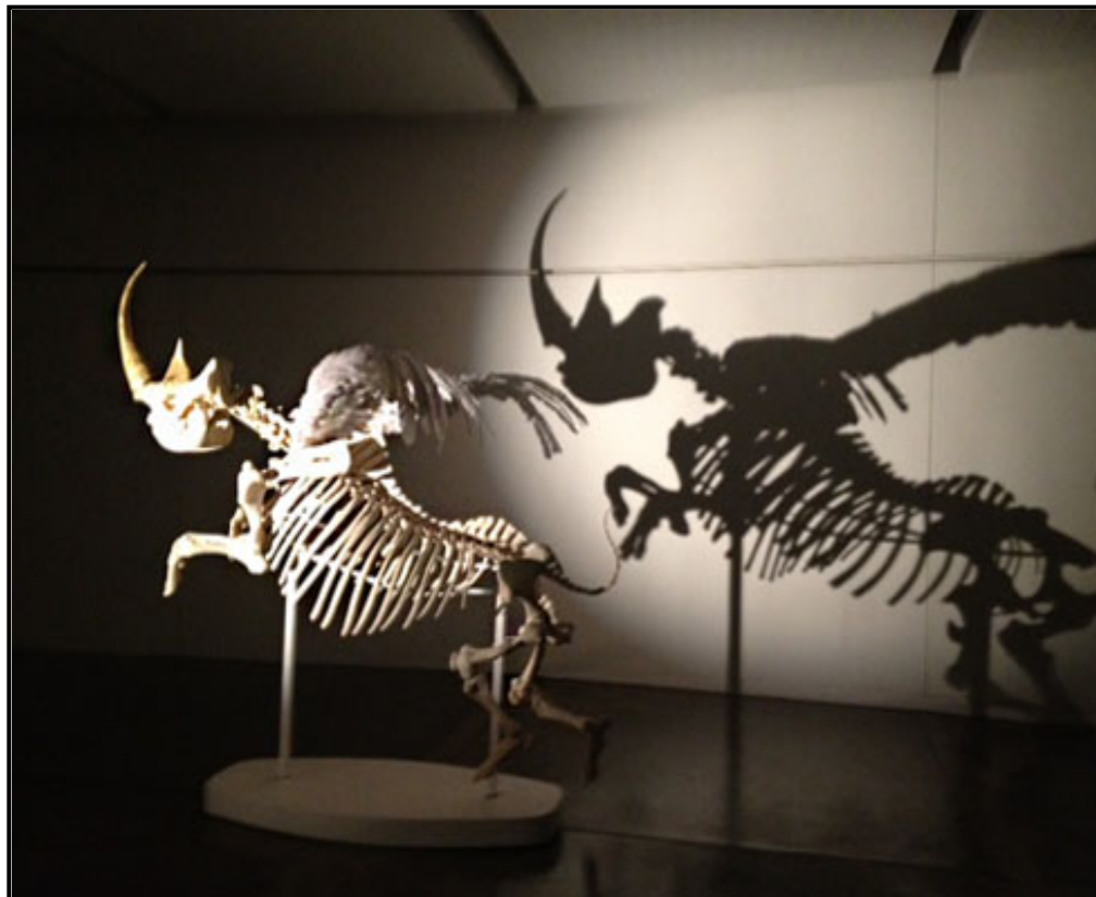
FIGURE 5b: Beezy Baily, As It Is in Heaven , rhino skeleton, gold leaf on resin horn, with plastic bird feather wings, 2012.