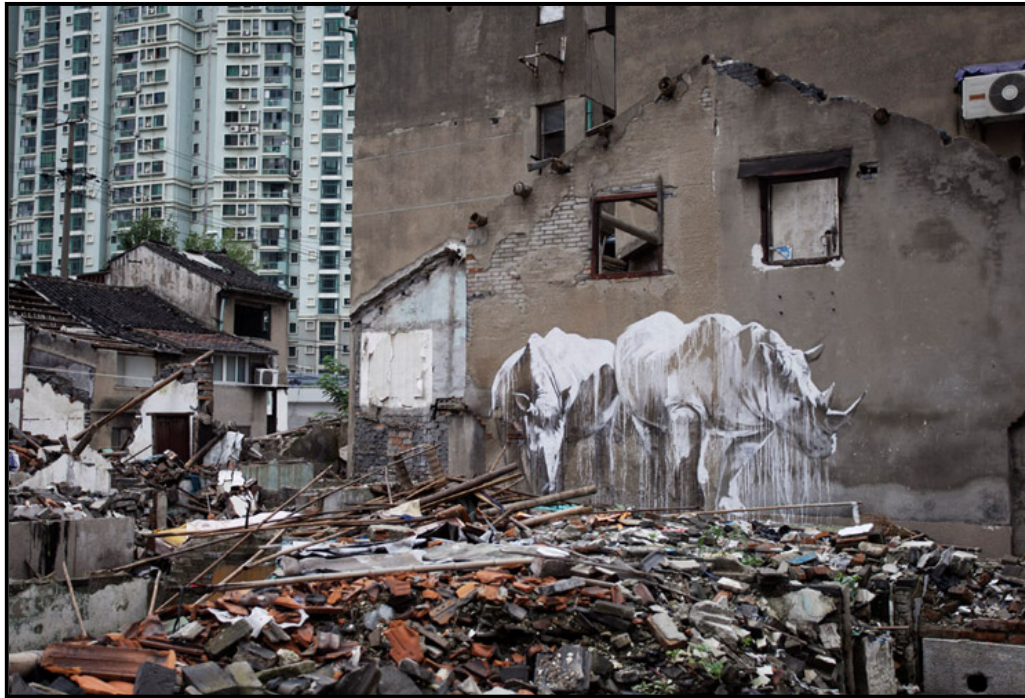
FIGURE 5a: Faith 47, Taming of The Beasts , mural art, acrylic paint and water-resistant conté, Shanghai, China, 2012.