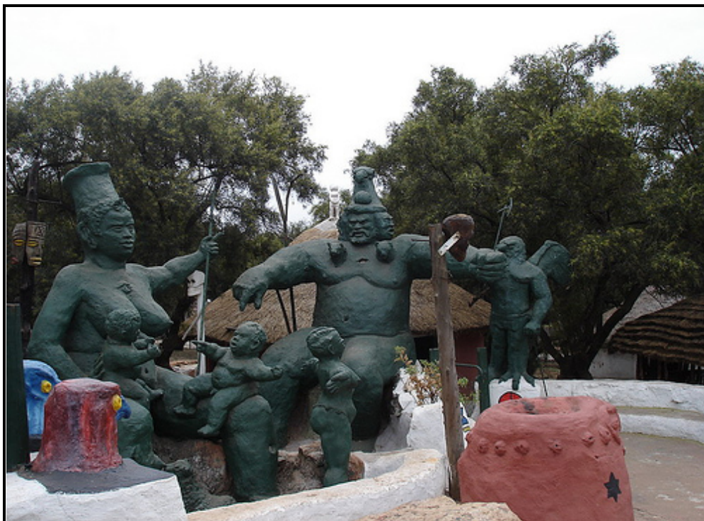
FIGURE 4b: Credo Mutwa, Nkulu Nkulu, God The Father and The Chief of Creation, and Nokhubuwana, God The Mother , Soweto cultural village, rubble, cement, wire and paint, 1974.