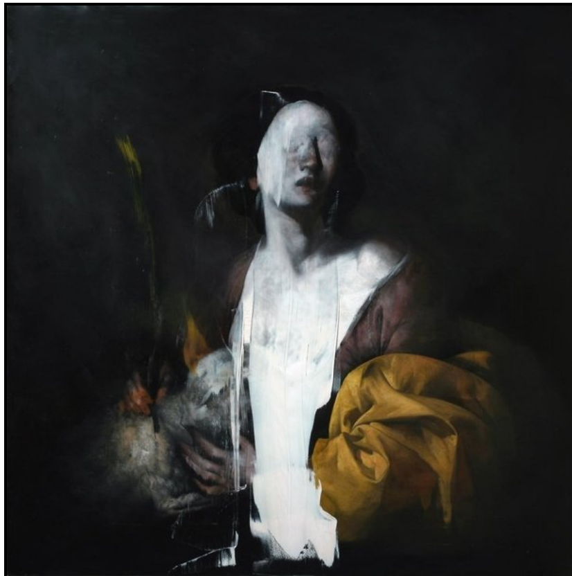
FIGURE 7b: Nicola Samori, Agnese , oil on copper, 2009.