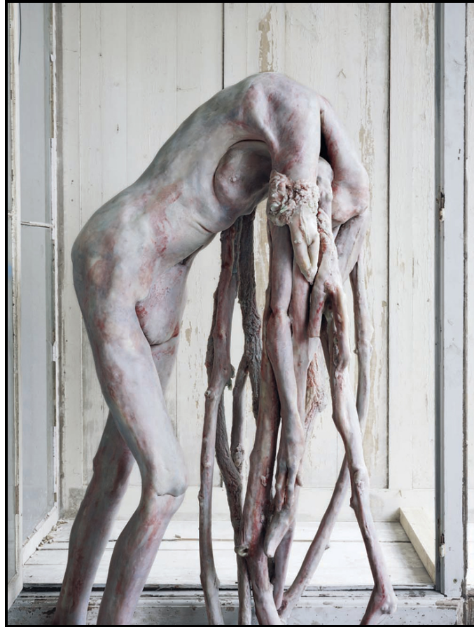
FIGURE 7a: Berlinda de Bruyckere, Marthe , wax, wood, wool, horse skin and hair, 1964.