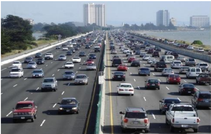
https://en.wikipedia.org/wiki/Traffic#/media/File:I-80_Eastshore_Fwy.jpg, October 2006