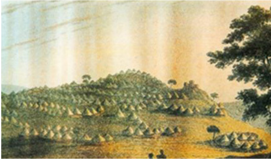
Figure 4: Houses

Question 22 refers to the following graphic