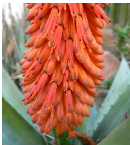
Figure 3: Aloe ferox 3

Question 20 refers to the following graphic