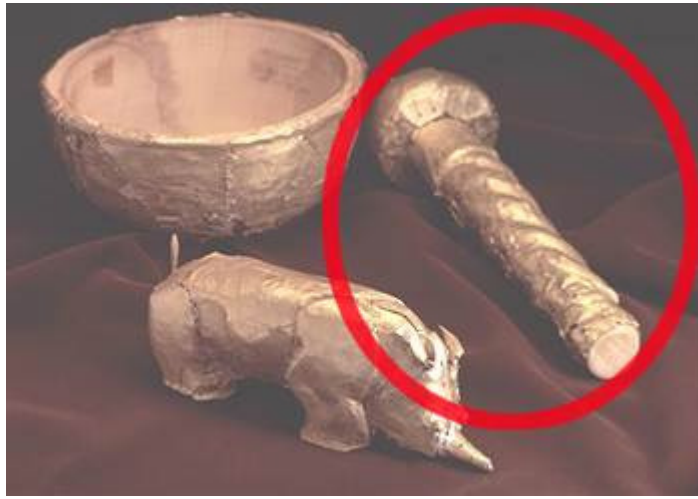
Figure 2: treasures