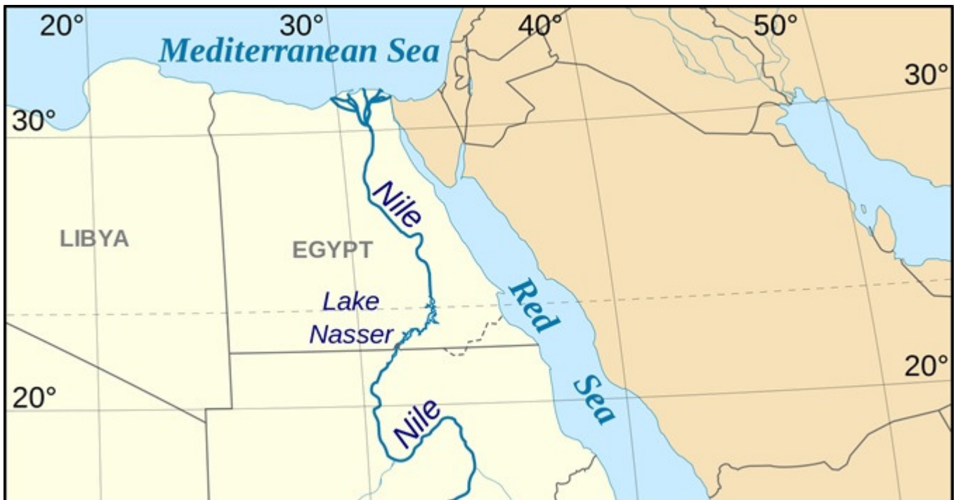
Figure 5: Mouth of Nile River

Question 23 refers to the following graphic