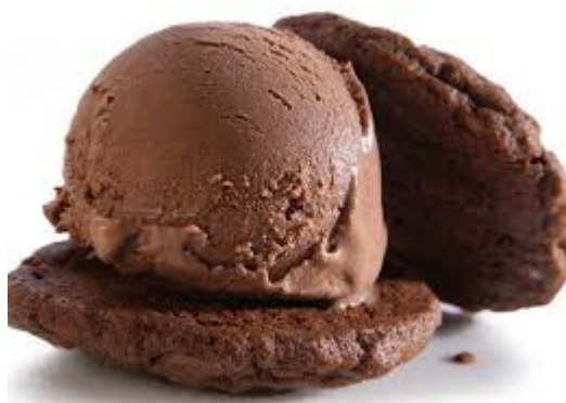
Figure 2: ice cream (1)

Questions 6 to 7 refer to the following graphic