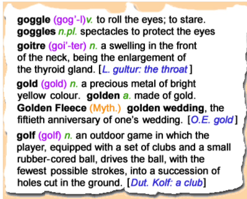
Figure 1: gr6dictionary

Questions 1 to 2 refer to the following graphic