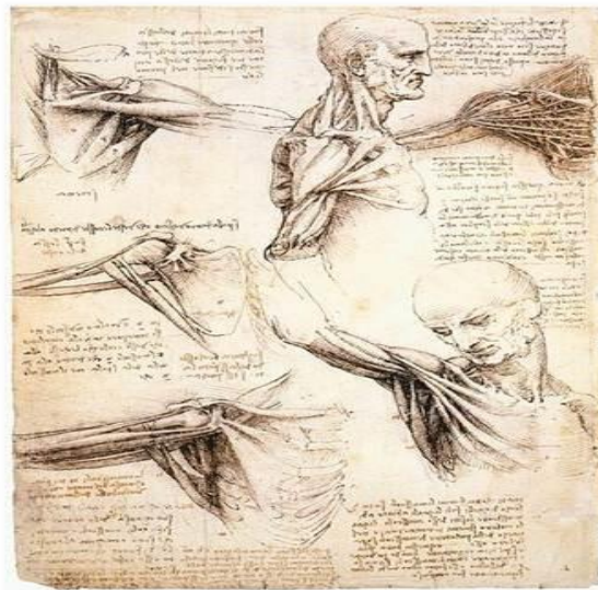
Leonardo Da Vinci – Anatomical studies of the shoulder. (2015). Wikimedia Commons (online). https://commons.wikimedia.org/wiki/File:Leonardo_da_Vinci_-_Anatomical_studies_of_the_shoulders_-_WGA12824.jpg (28/03/2016).

Leonardo Da Vinci studied the human body (anatomy) by studying and drawing dead people's bodies.