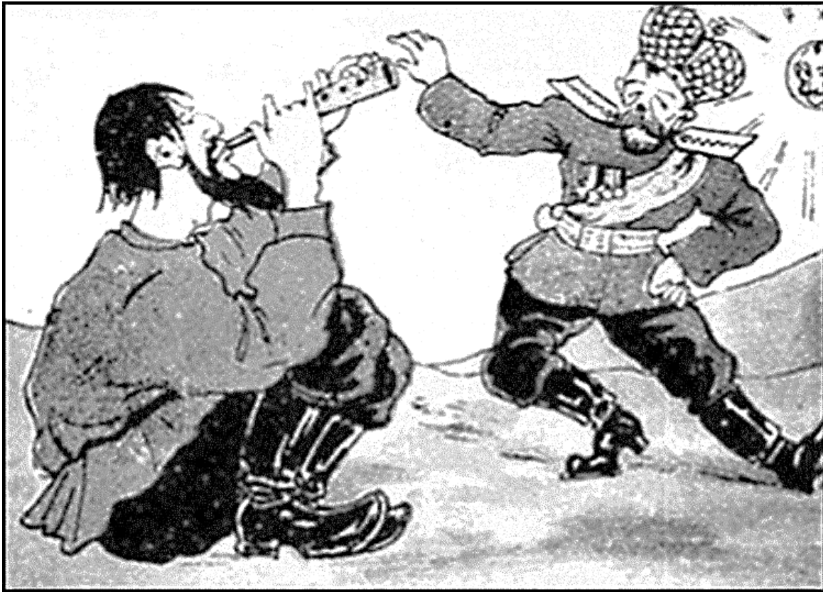
[Adapted from http://sfr-21.org/war-communism.html . Accessed on 05 April 2018.]

This source depicts the influence of Rasputin over the Aristocracy.