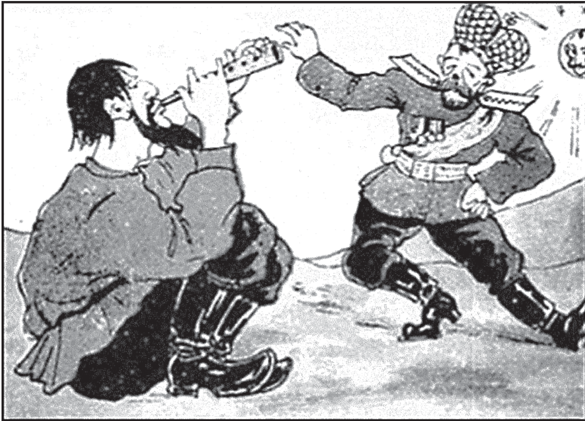
[Adapted from http://sfr-21.org/war-communism.html . Accessed on 05 April 2018.]

This source depicts the influence of Rasputin over the Aristocracy.