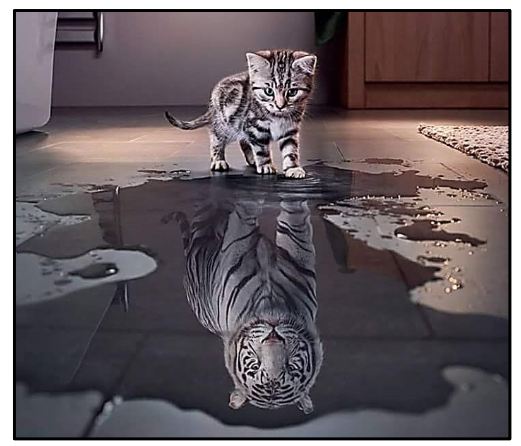
[Based on a painting by Mahesh]