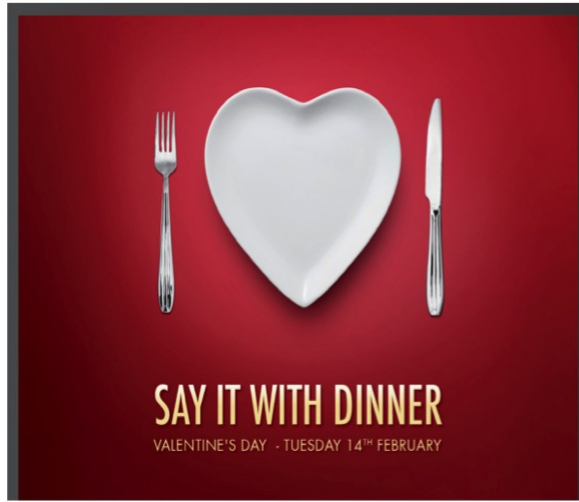
Figure 7: VDay Dinner