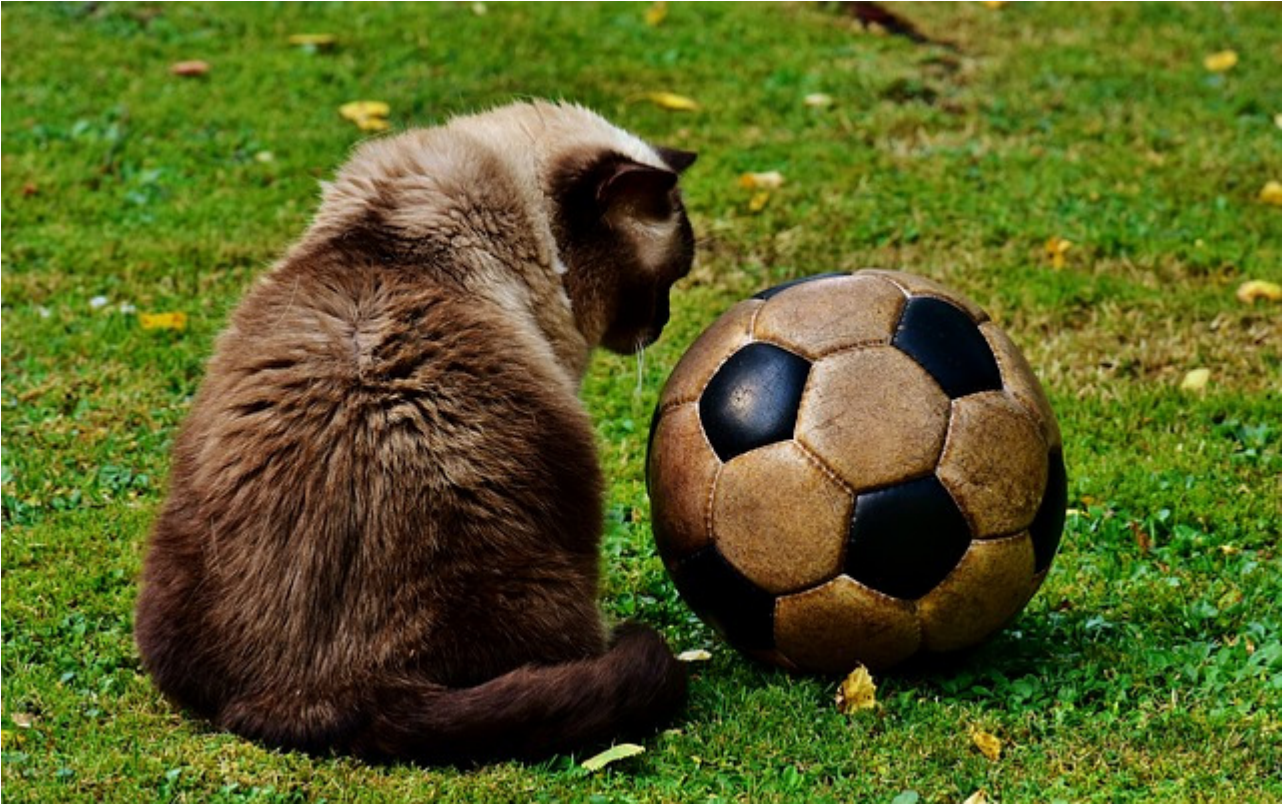
Figure 3: cat and ball

Question 16 refers to the following graphic