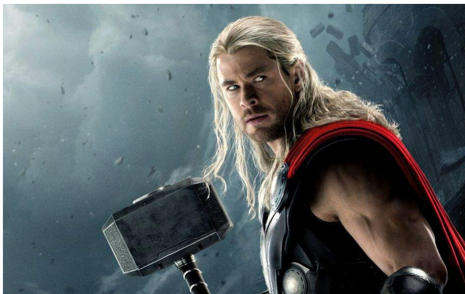
Figure 6: Thor - hero

Question 29 refers to the following graphic