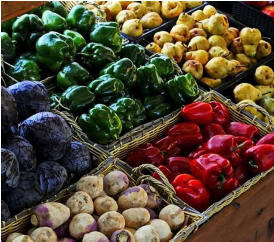
Figure 11: fresh food