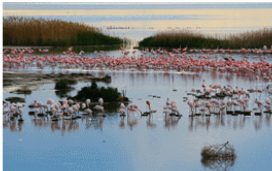
Figure 6: wetlands

Question 12 refers to the following graphic