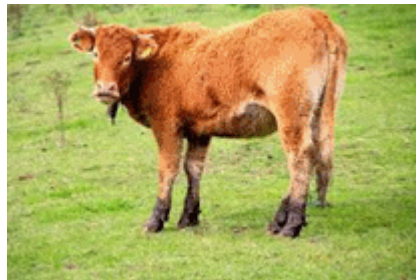
Figure 2: Cow

Question 2 refers to the following graphic