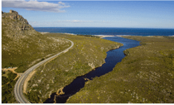
Figure 13: Palmiet River