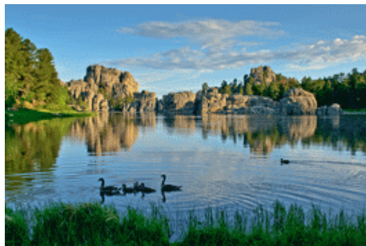
Figure 4: nature

Question 10 refers to the following graphic