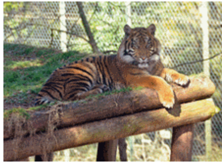
Figure 3: Tiger