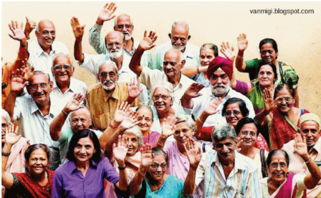
Figure 7: senior-citizens

Question 13 refers to the following graphic