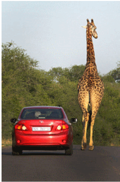
Figure 5: Wildlife