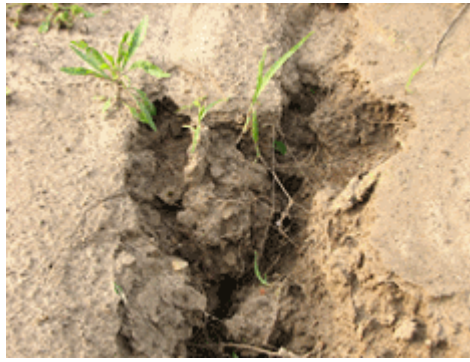
Figure 12: erosion