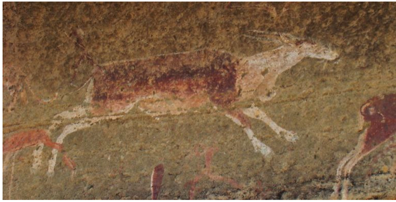
Figure 2: eland