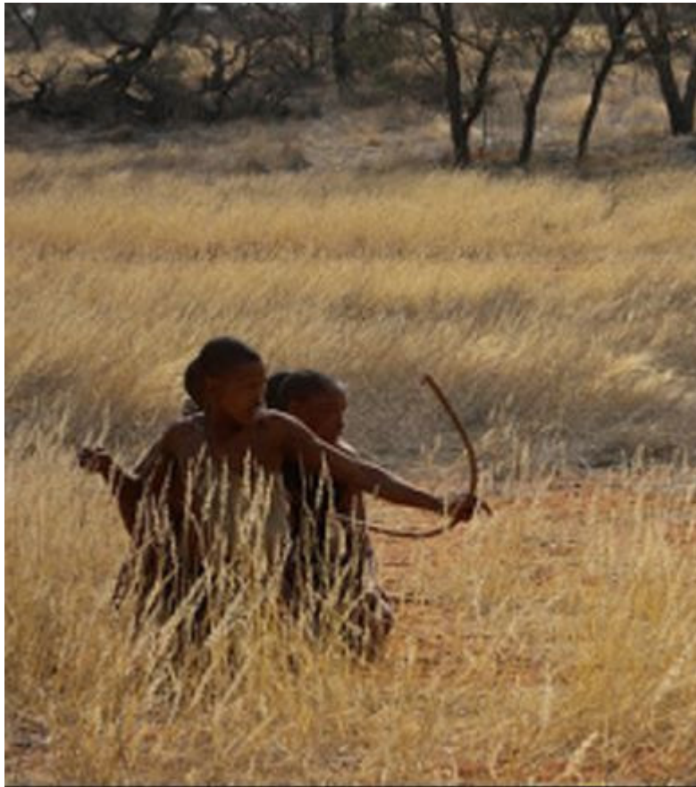
Figure 1: bow and arrow